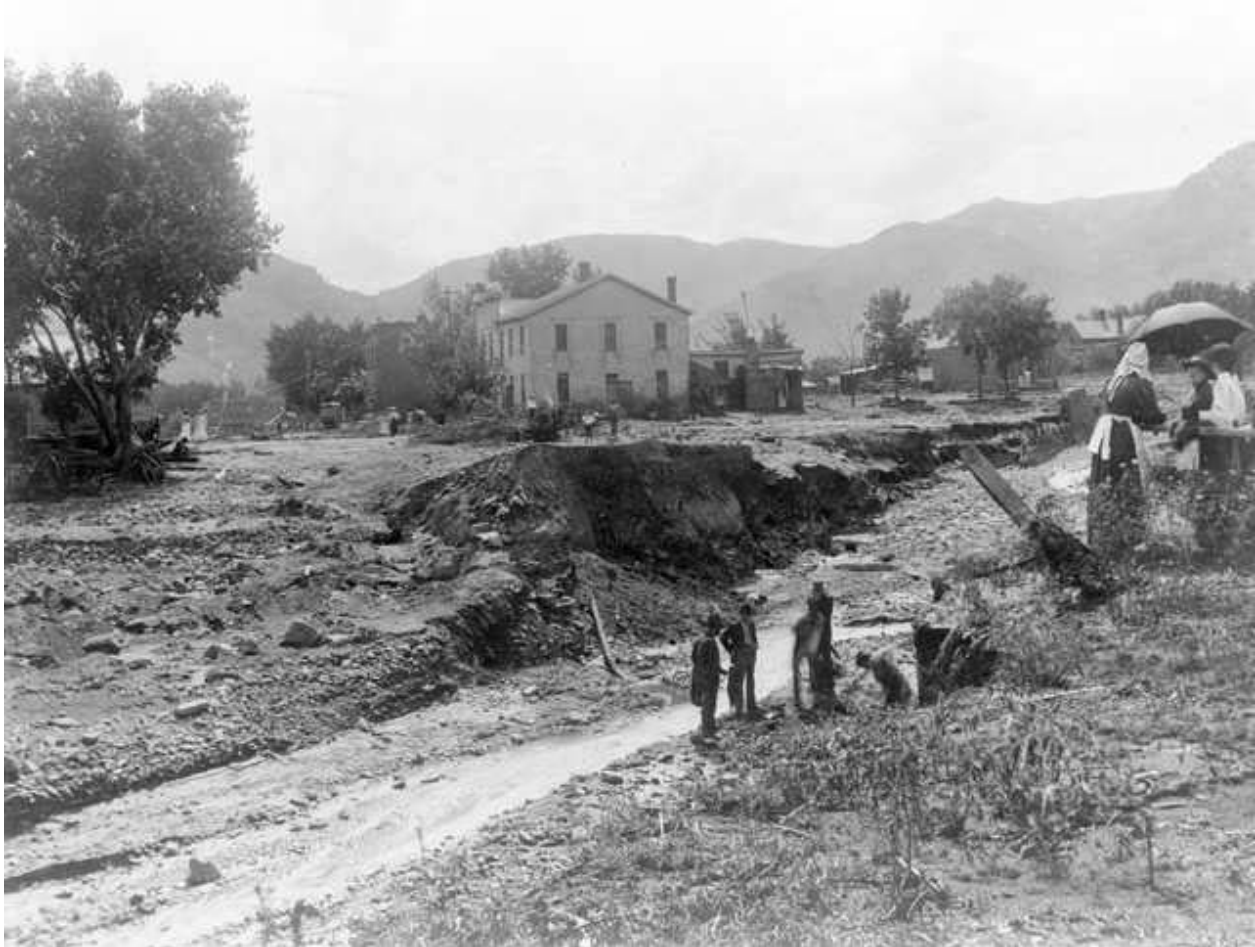
Tucker Gulch Flood of July 24, 1896 near 10th and Ford Streets in Golden, Colorado

Newspaper accounts and other historical records of flooding in the Golden area date as far back as 1864. A number of the accounts pertained to flooding on Clear Creek with little or no mention of flooding on Tucker Gulch or Kenneys Run (e.g. floods of 1864, 1888 and 1933). Although no stream flow records exist for either Tucker Gulch or Kenneys Run, other reports of past flooding did give a clear picture of the flood damage potential of these two normally dry streams. The newspaper articles and past reports researched as part of this study provided information regarding six major flood events on Tucker Gulch (Golden Gate Canyon) and Kenneys Run over the past 110 years. The floods of 1872, 1896, 1941, 1948, 1965 and 1973 were reported as follows: