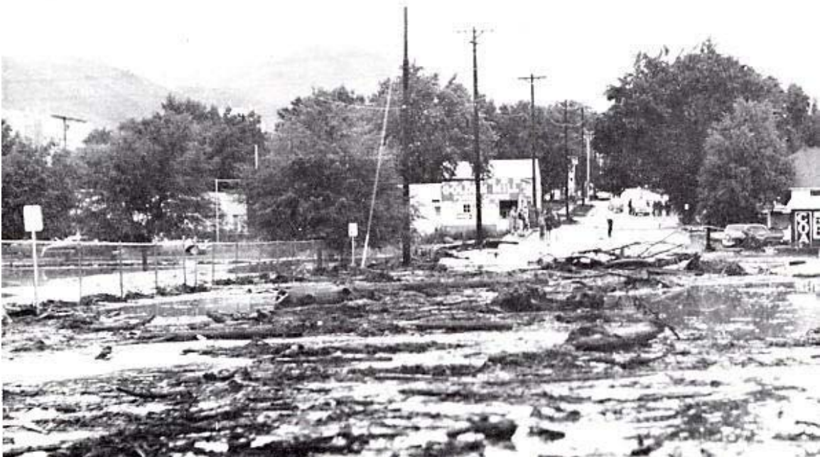
#2 Looking north at Ford Street bridge over Clear Creek