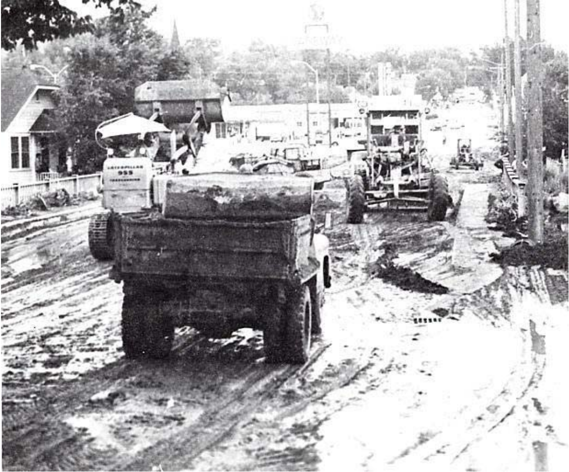
#6 Looking south at Ford Street bridge over Clear Creek