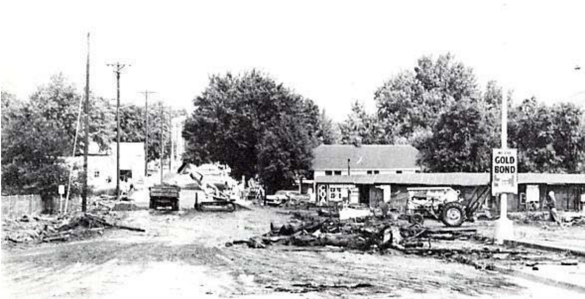
#5 Looking north at Ford Street bridge over Clear Creek