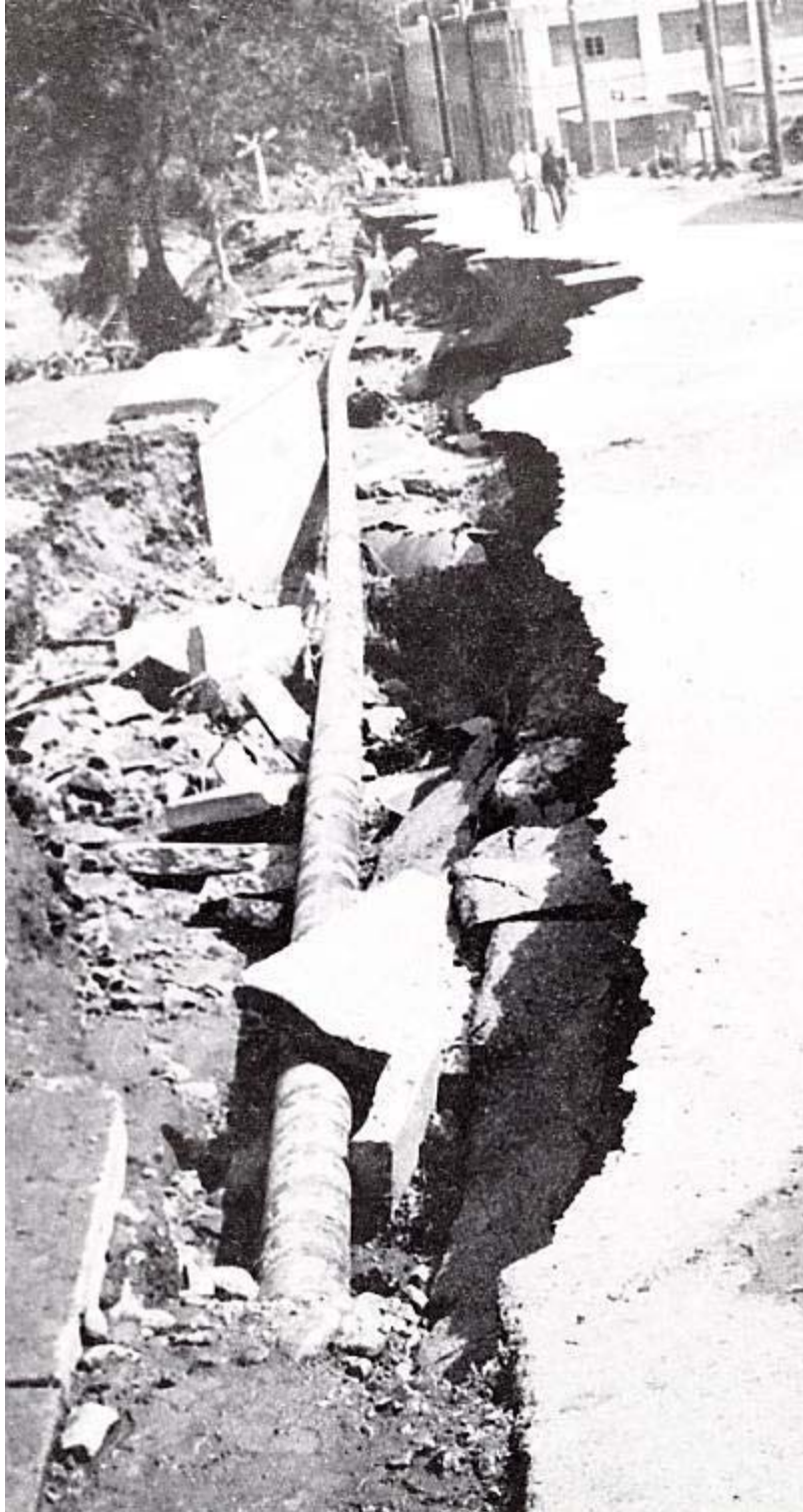
#3 Looking south along Ford Street