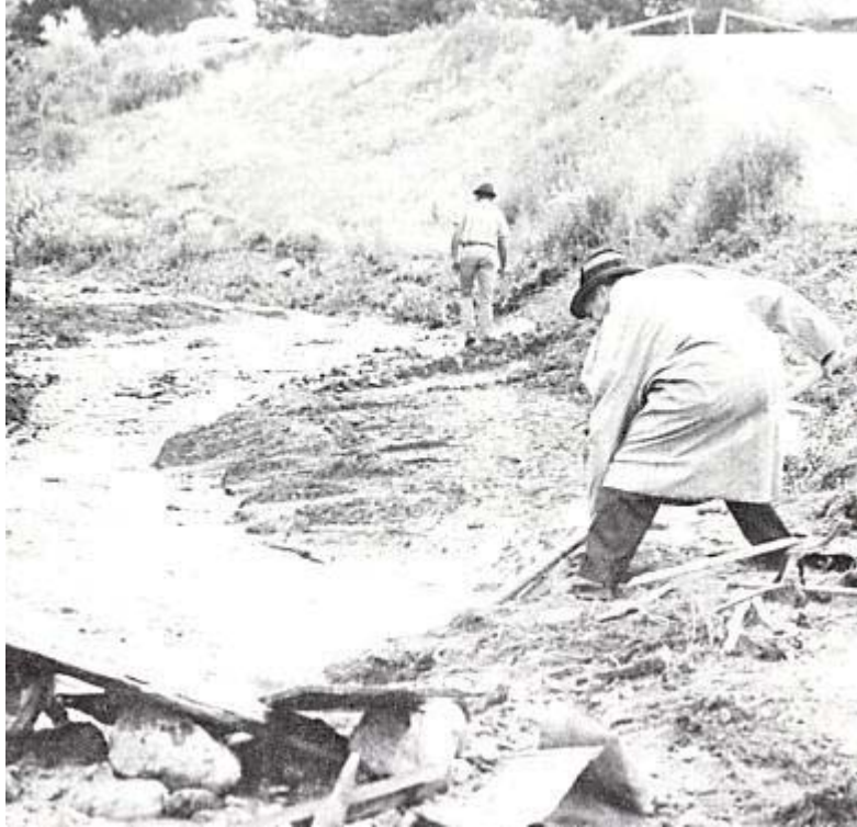
#4 Looking upstream from old road crossing of Tucker Gulch near location of 7th Place bridge