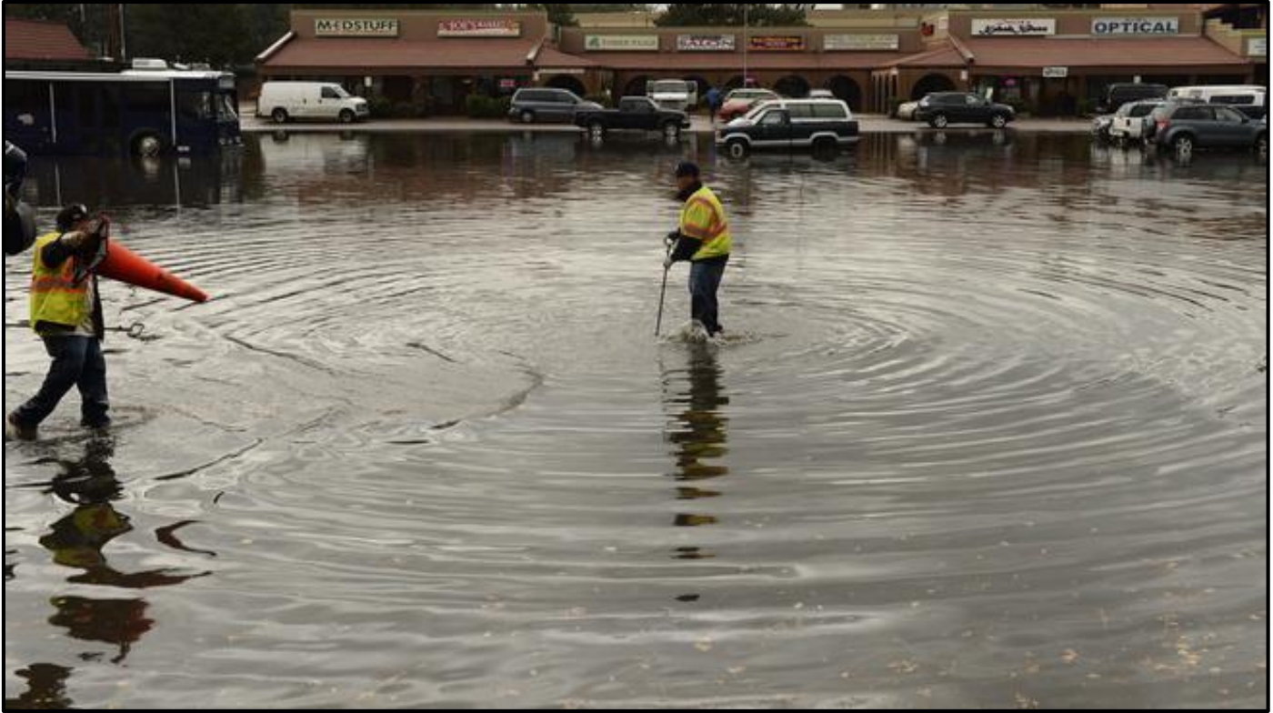
Figure 2: September 29 th , 2014 flooding in the City of Aurora.

In summary the 2014 flood season did not have a signature event that stands out as the leader in the heavy rainfall department. What made this year unique was the amount of moisture that remained in place from May through August with dew points spending much of the time in the 50's. This resulted in a high number of days with a potential flood risk due to meteorological conditions. Storm motions remained fast enough through the season to keep most of the heavier rainfall brief with the higher rain totals this season resulting from training of thunderstorm cells. There was not any major flooding this season but there was a lot of low level "nuisance" type flooding. Above normal precipitation was observed in the months of May, July and August with each month more than 1" above the normal. The rainfall had many benefits one of which was the lack of wildland fire activity with no large fires in or around the District and allowing older burn scars to continue the healing process.