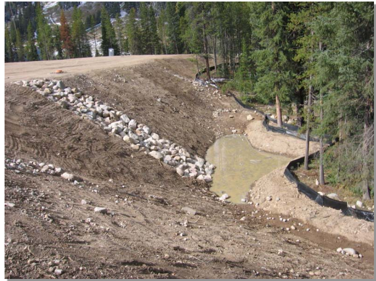
Photograph SB-1. Sediment basin at the toe of a slope.

A sediment basin is a temporary pond built on a construction site to capture eroded or disturbed soil transported in storm runoff prior to discharge from the site. Sediment basins are designed to capture site runoff and slowly release it to allow time for settling of sediment prior to discharge. Sediment basins are often constructed in locations that will later be modified to serve as post-construction stormwater basins.