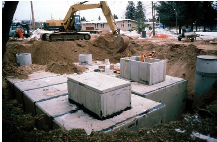
Photograph UG-1. Installation of an underground BMP (Photo courtesy of Robert Pitt).

Underground stormwater BMPs include proprietary and non-proprietary devices installed below ground that provide stormwater quality treatment via sedimentation, screening, filtration, hydrodynamic separation, and other physical and chemical processes. Conceptually, underground BMPs can be categorized based on their fundamental treatment approach and dominant unit processes as shown in Figure UG-1. Some underground BMPs combine multiple unit processes to act as a treatment train.