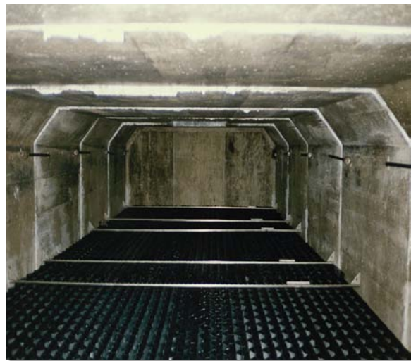
Photograph UG-2. Maintenance access to all chambers of an underground BMP is an important design consideration.

The maintenance plan should specify, at a minimum, quarterly inspections with maintenance performed as needed based on inspections. The required inspection frequency may be reduced to biannually if, after two or more years, the quarterly regimen demonstrates that this will provide adequate maintenance. Local governments may consider requiring owners of underground BMPs to provide written inspection and maintenance documentation to better assure that required inspection and maintenance activities are taking place. When the BMP includes a pump system, pump inspection and maintenance records should also be included.