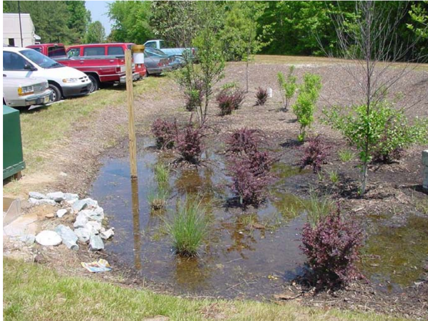
Typical bioretention cell, a.k.a. rain garden